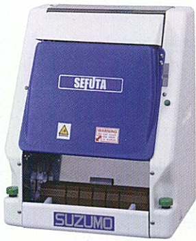
Automatic NORI-MAKI Cutter SVC-ATX

This Small Machine offers big improvements in productivity and quality!